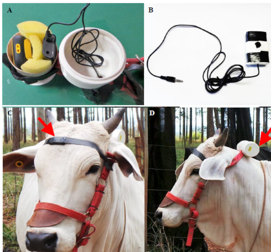
Figure 1 - Bioacoustics equipment and their positions: (A) Recorder inside of the capsule of PVC; (B) Lapel microphone inserted in a Styrofoam capsule. (C) Microphone positioned in the front; (D) Capsule fixed to the vessel, positioned behind the marrafa.

x 15cm), closed with a windshield cover, in which, at one end, there was a hole for the microphone cable to pass through. The microphone was inserted into a Styrofoam capsule and positioned on the animal's forehead by means of a rubber band. The equipment was fixed to the halter with the aid of adhesive tape and nylon clamps and positioned at the nape of the neck, as shown in Figure 1.